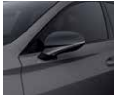
GRAPHENE GREY** OP