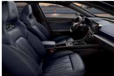
PETROL BLUE + DARK ALUMINIUM DECORATIVE INSERTS