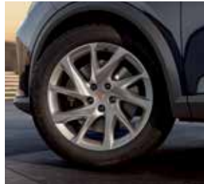
18" PERFORMANCE SILVER ALLOY WHEEL