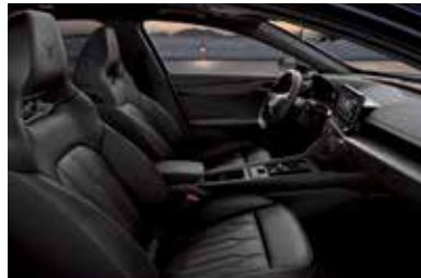
SOUL BLACK + DARK ALUMINIUM DECORATIVE INSERTS