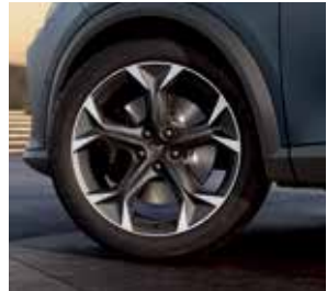
19" MACHINED ALLOY IN SPORT BLACK & SILVER