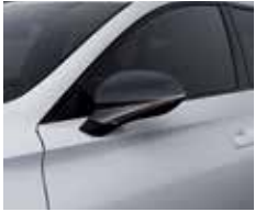
NEVADA WHITE* ST