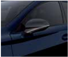
ASPHALT BLUE* ST