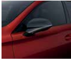
DESIRE RED** OP