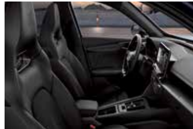
SHARP UPHOLSTERY + DARK ALUMINIUM DECORATIVE INSERTS