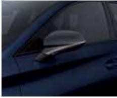
ASPHALT BLUE* ST