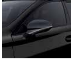
MIDNIGHT BLACK* ST