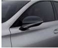
URBAN SILVER* ST