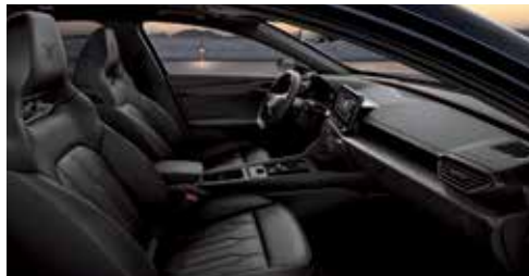
SOUL BLACK + DARK ALUMINIUM DECORATIVE INSERTS