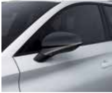
NEVADA WHITE* ST