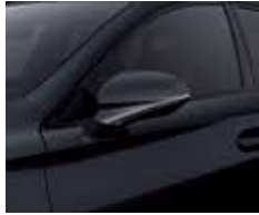
MAGNETIC TECH* ST