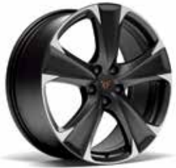
19" MACHINED ALLOY IN SPORT BLACK & SILVER