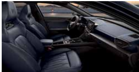
PETROL BLUE + DARK ALUMINIUM DECORATIVE INSERTS